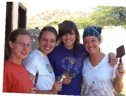
Do they look like they're having too much fun? More paint on themselves than on the walls!