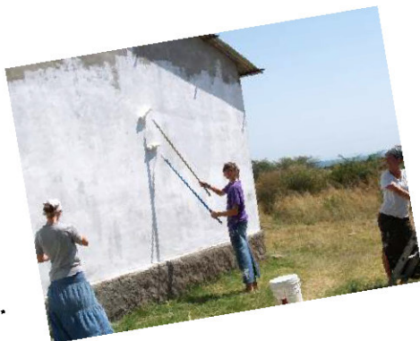
We were trying to figure out how those painters were able to get so much painted so quickly! Two rollers must be better than one....